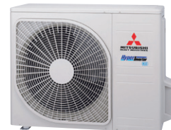
SRC40ZSX-W1, SRC50ZSX-W2, SRC60ZSX-W1