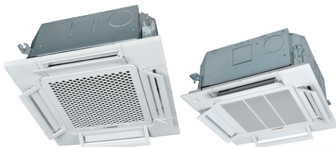
FDTC25VH1, FDTC35VH1, FDTC40VH, FDTC50VH, FDTC60VH